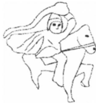
Figure Two: Mounted Sarmatian (Chester); Drawn by Linda A. Malcor after Littleton and Malcor 1994, 14, plate 3.

Position during battle and garb are not the only things that mark Merlin as Arthur's draconarius . There was a tradition in the Middle Ages that a very special standard belonged in Merlin's hand. This was Arthur's standard, the famous 'Pendragon'.